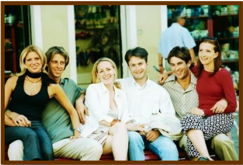
Couples are waiting for your coaching.